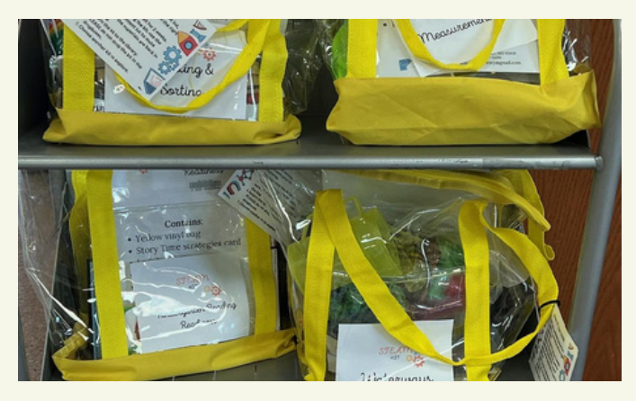
Available Kits for Checkout

The library has STEAM kits available for checkout to keep children continuing to learn over the summer.